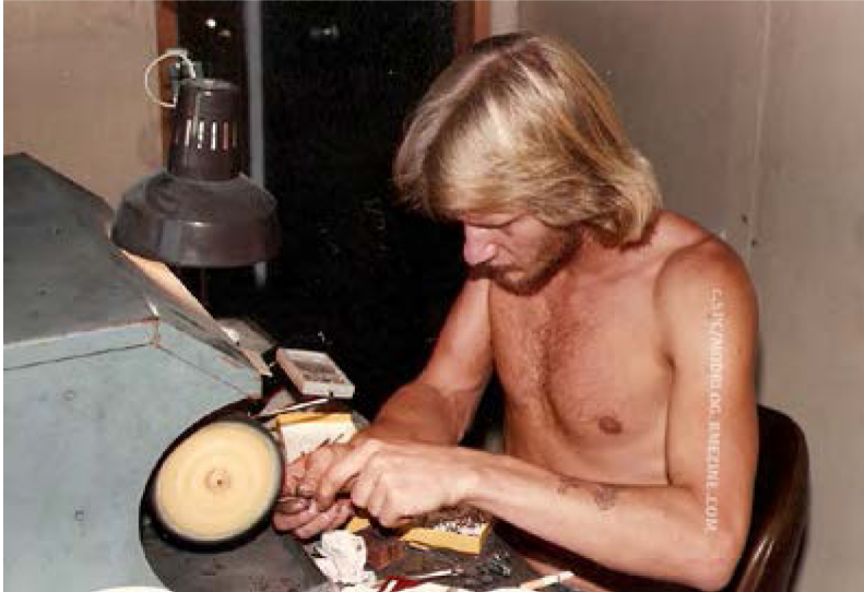
A jeweler at Silver Anchor, circa 1980s.